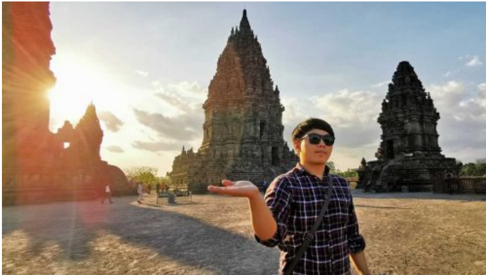
Golden Hour featured Prambanan Temple

Do not forget to enjoy the beautiful Prambanan Temple when in Yogyakarta. Oh, also take some photos in the middle of golden hour is a must!