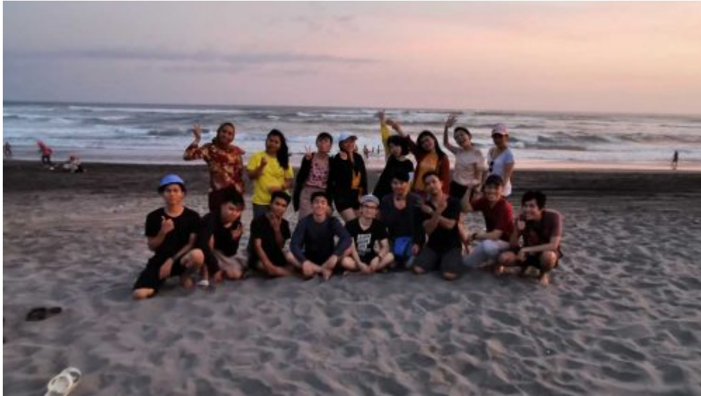
Enjoying Sunset at Parangtritis Beach