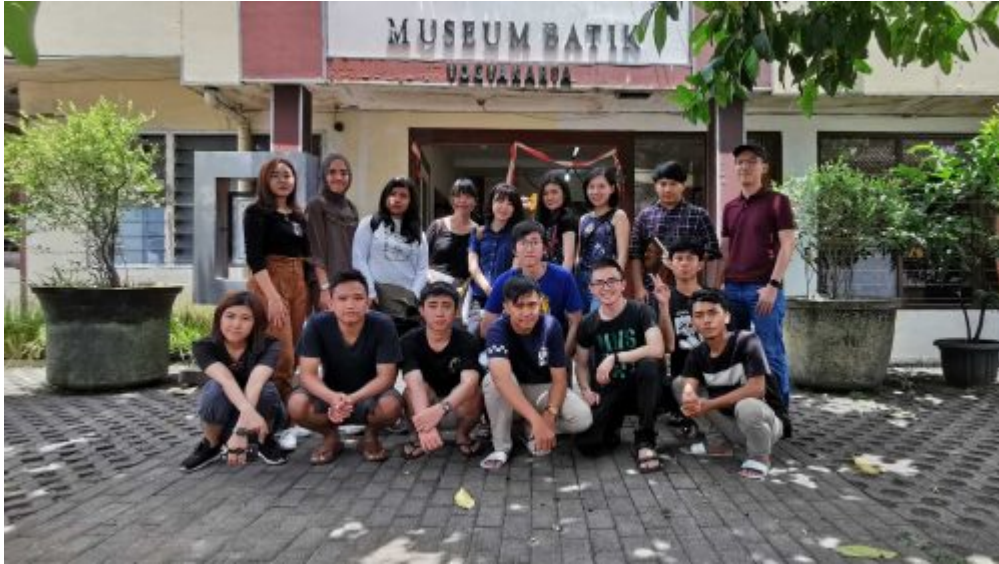
Challenge Accepted at Museum Batik Yogyakarta

Do not forget to enjoy the beautiful Prambanan Temple when in Yogyakarta. Oh, also take some photos in the middle of golden hour is a must!