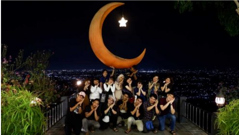
A Night to Remember at The Manglung, Bukit Bintang

Our last lunch at House of Raminten to close our last day in Yogyakarta. After that, it's time to return home with lot of sweet memories. See you in another time!