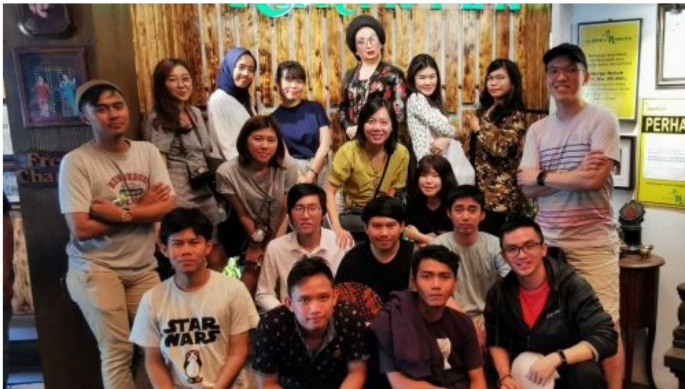
It Was A Wrap, We Left our Hearts at Yogyakarta

Our last lunch at House of Raminten to close our last day in Yogyakarta. After that, it's time to return home with lot of sweet memories. See you in another time!